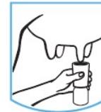
Teat Dip Baño de tetina

Read other label for directions for use, first aid and precautionary statements Lea la otra etiqueta para direcciones de uso, primeros auxilios y medidas preventivas