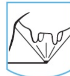
Teat Spray Roceador de tetina