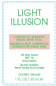
M3 CLASSIC TAN 30-126-FLW-2025