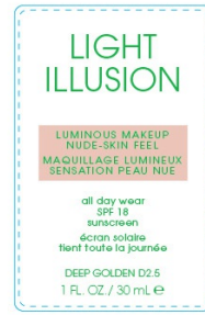
D2.5 DEEP GOLDEN 30-126-FLW-2021