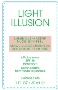
M5 CARAMEL 30-126-FLW-2023