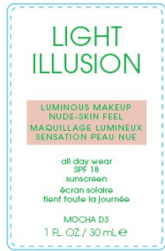
D3 MOCHA 30-126-FLW-2029