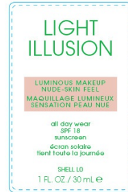
L0 SHELL 30-126-FLW-2019