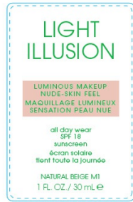
M1 NATURAL BEIGE 30-126-FLW-2031