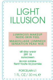
L1 PORCELAIN 30-126-FLW-2037