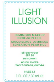
L3 NUDE 30-126-FLW-2033