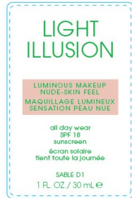
D1 SABLE 30-126-FLW-2039