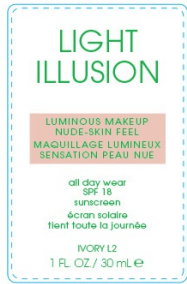
L2 IVORY 30-126-FLW-2027