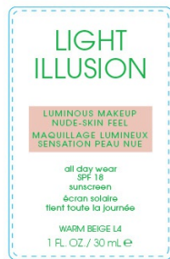
L4 WARM BEIGE 30-126-FLW-2045