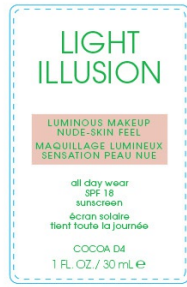
D4 COCOA 30-126-FLW-2017