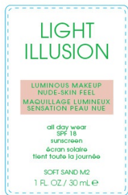
M2 SOFT SAND 30-126-FLW-2041