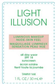
M4 TAWNY 30-126-FLW-2043