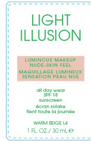
L4 WARM BEIGE 30-126-FLW-2045