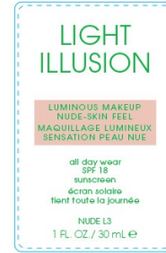
L3 NUDE 30-126-FLW-2033