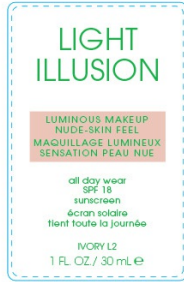
L2 IVORY 30-126-FLW-2027