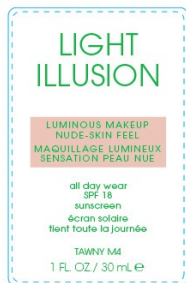
M4 TAWNY 30-126-FLW-2043