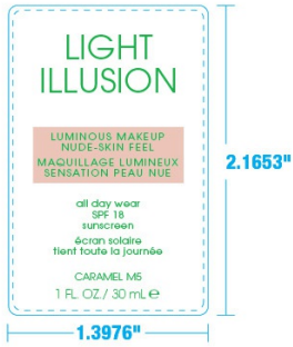
M5 CARAMEL 30-126-FLW-2023