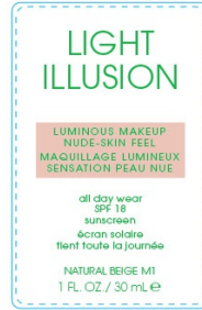
M1 NATURAL BEIGE 30-126-FLW-2031