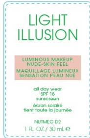
D2 NUTMEG 30-126-FLW-2035