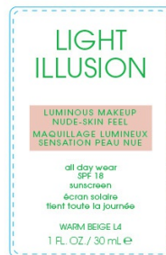
L4 WARM BEIGE 30-126-FLW-2045