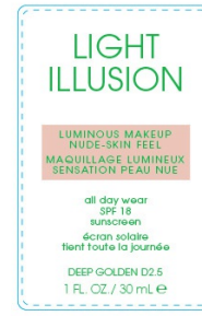
D2.5 DEEP GOLDEN 30-126-FLW-2021