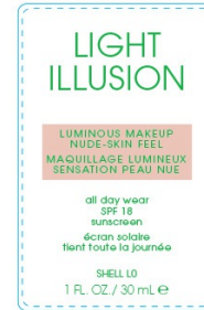
L0 SHELL 30-126-FLW-2019