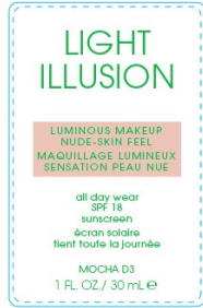
D3 MOCHA 30-126-FLW-2029