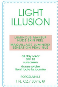
L1 PORCELAIN 30-126-FLW-2037