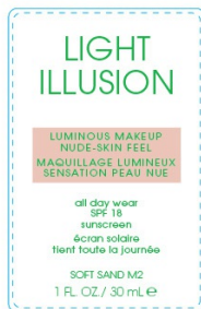
M2 SOFT SAND 30-126-FLW-2041