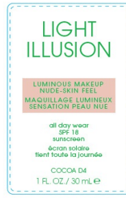
D4 COCOA 30-126-FLW-2017