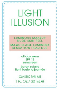
M3 CLASSIC TAN 30-126-FLW-2025