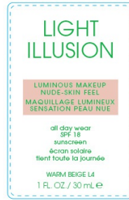
L4 WARM BEIGE 30-126-FLW-2045