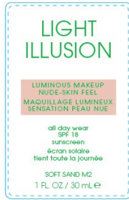
M2 SOFT SAND 30-126-FLW-2041