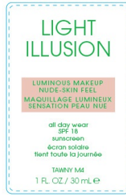
M4 TAWNY 30-126-FLW-2043