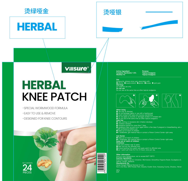
彩盒尺寸: 135mm×195mm×18.5mm 材质: 350g白卡 工艺: 4C+烫哑金+烫哑银+丝印uv 颜色: 4c