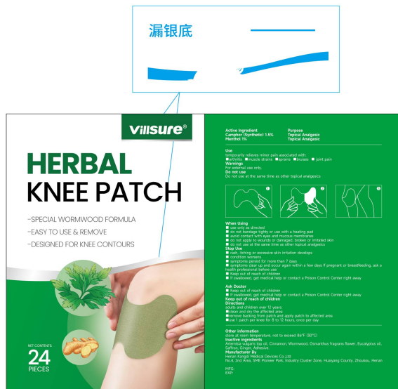
内袋 展开尺寸: 135mm×188mm 材质: 铝箔袋 工艺: 印后过哑油 颜色: 跟外盒