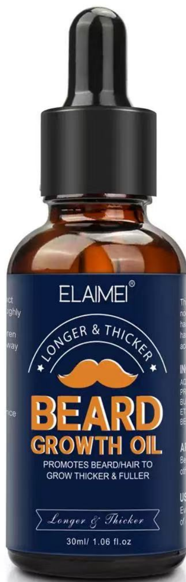
Beard Growth Essence