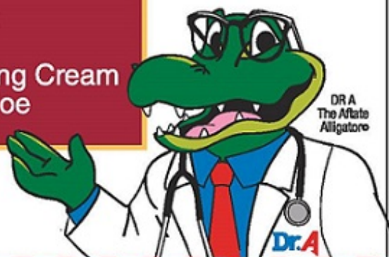
DR A The Aftate Alligator