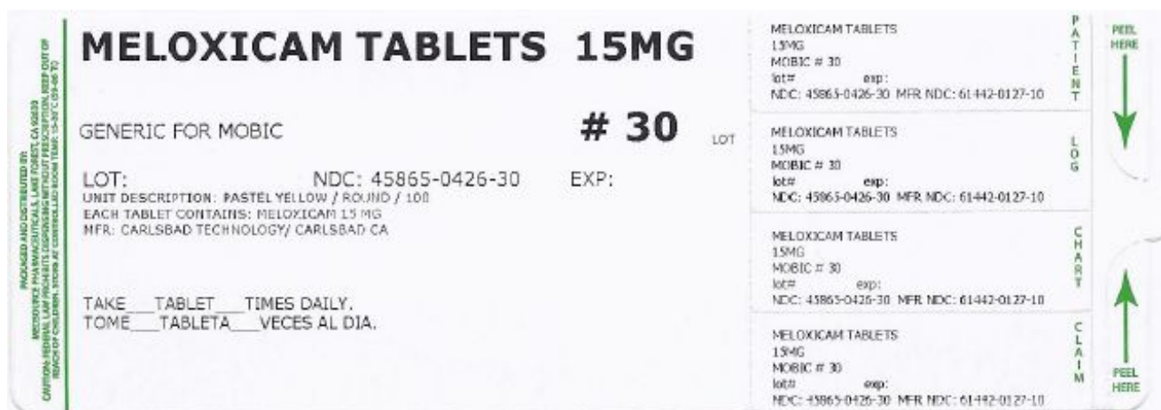
Meloxicam 15mg Tablets