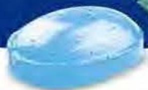
NOT ACTUAL SIZE