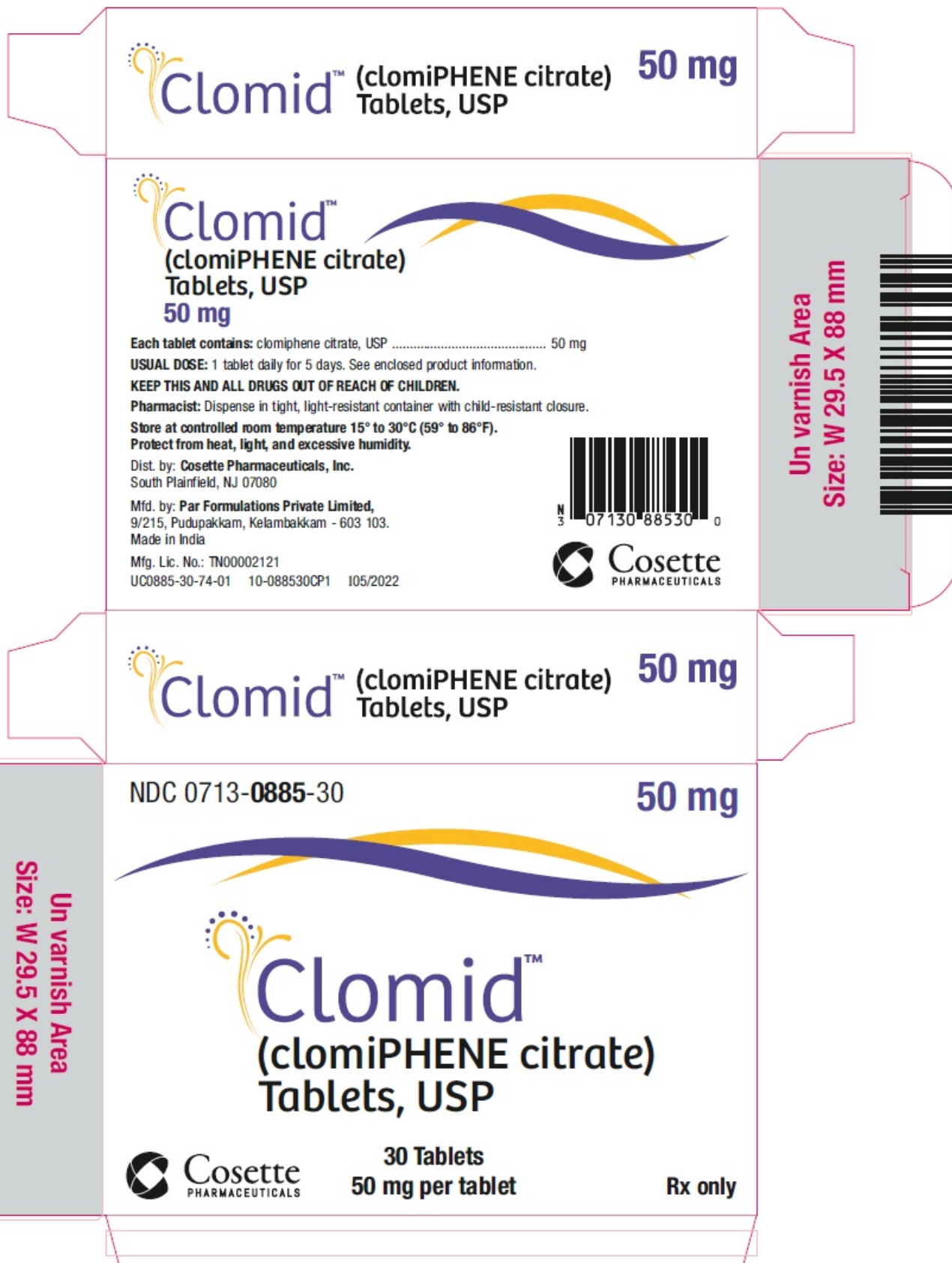
PRINCIPAL DISPLAY PANEL - BLISTER 50 MG TABLETS