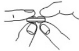
two-thirds tablet side view (with thumb and index finger)

50 mg treatment (take one-third of the tablet)