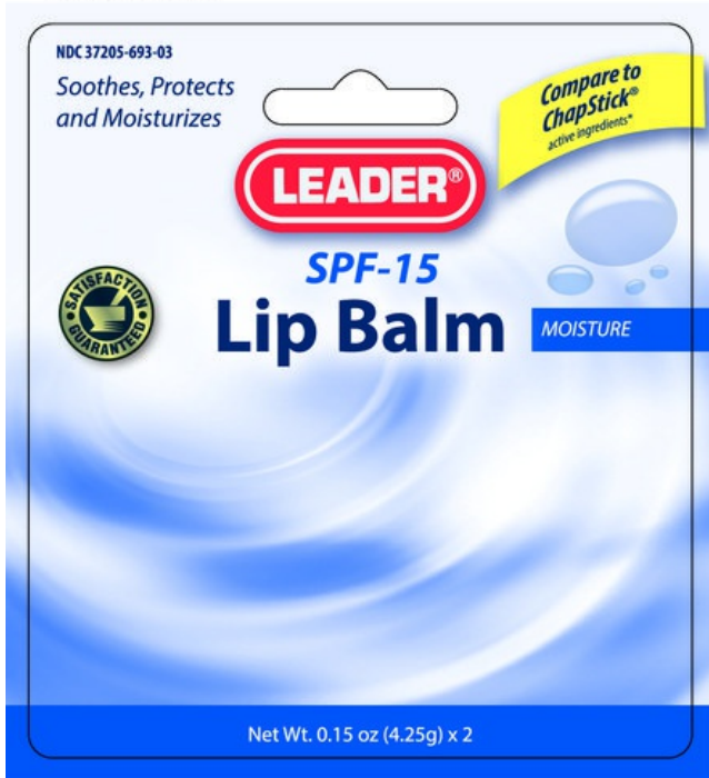
Back of Card