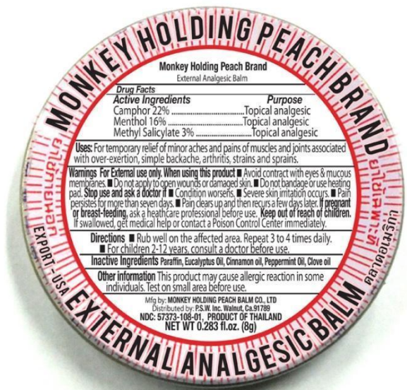
Nirvana_White Monkey Blam Can_040414_Rev.06