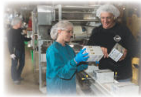
Tom's of Maine® Factory Sanford, Maine

A natural anticavity toothpaste at a super value - every day!