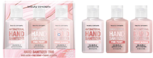
10315-3- -8 (GIABHS04) label