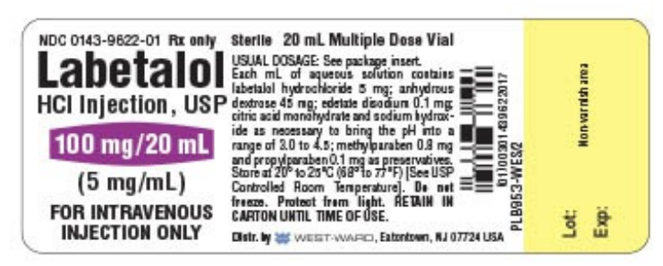
Labetalol Hydrochloride 20 ml vial label