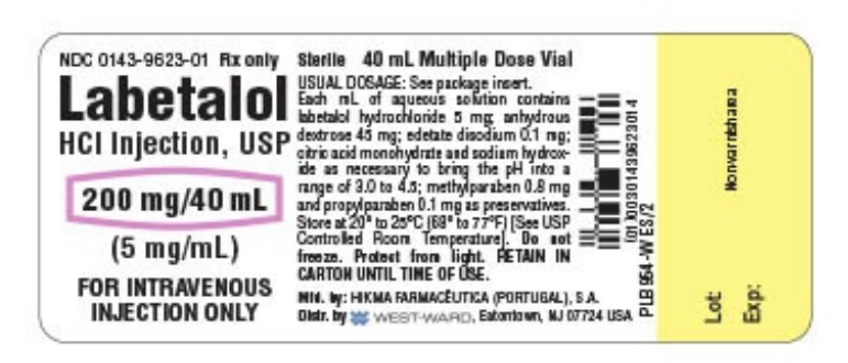
Labetalol Hydrochloride 40 ml vial label