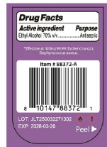
Back Sticker (cover)