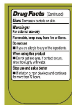
Page 1 (Inside Cover)