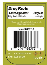
Back Sticker (cover)