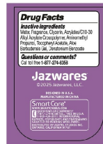
Page 3 (Inside Cover)