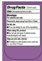
Page 1 (Inside Cover)