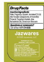
Page 3 (Inside Cover)