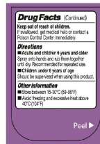
Page 2 (Inside Cover)