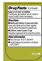
Page 2 (Inside Cover)