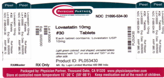
PACKAGE/LABEL PRINCIPAL DISPLAY PANEL