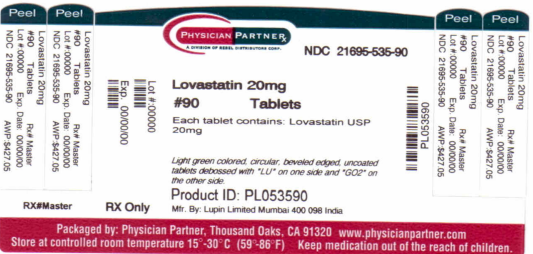
PACKAGE/LABEL PRINCIPAL DISPLAY PANEL