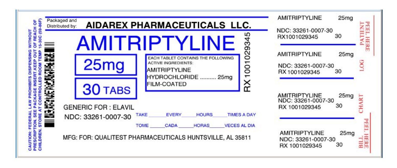
PRINCIPAL DISPLAY PANEL