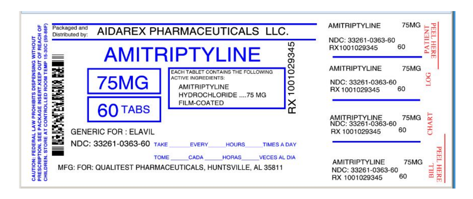
PRINCIPAL DISPLAY PANEL