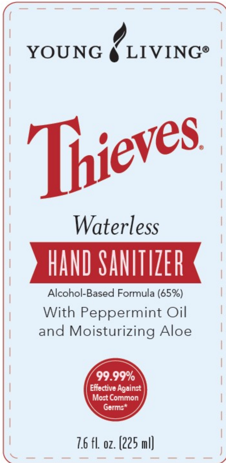
Thieves Waterless Hand Sanitizer

Thieves Waterless Hand Sanitizer 225ml Facts Panel, NDC: 70631-142-76