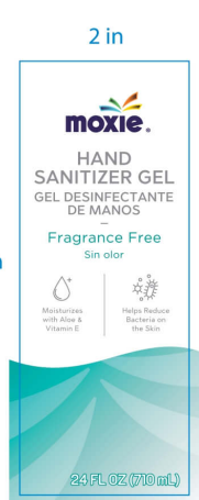
FRONT WHITE SUBSTRATE