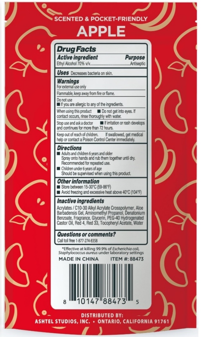
Inner Package Label