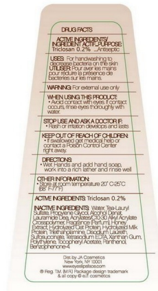
BACK LABEL 2.5 cm W x 4.5 cm W x 9.5 cm L