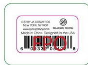
BOTTOM UPC LABEL .19 cm W x 3.2 cm L