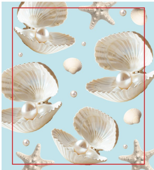
INSIDE LABEL (WITH GLUE)

If swallowed, get medical help or contact a Poison Control Center right away.