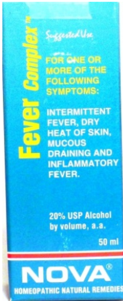
Fever Complex Bottle Label