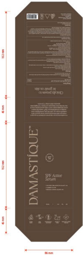
内衬 inside of lid