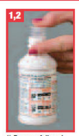
Remove foil seal. Insert bottle adapter.

This product has a simple rotating label that allows you to find your child's weight-based dose.