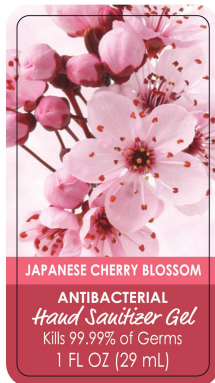
BACK ADHESIVE SIDE