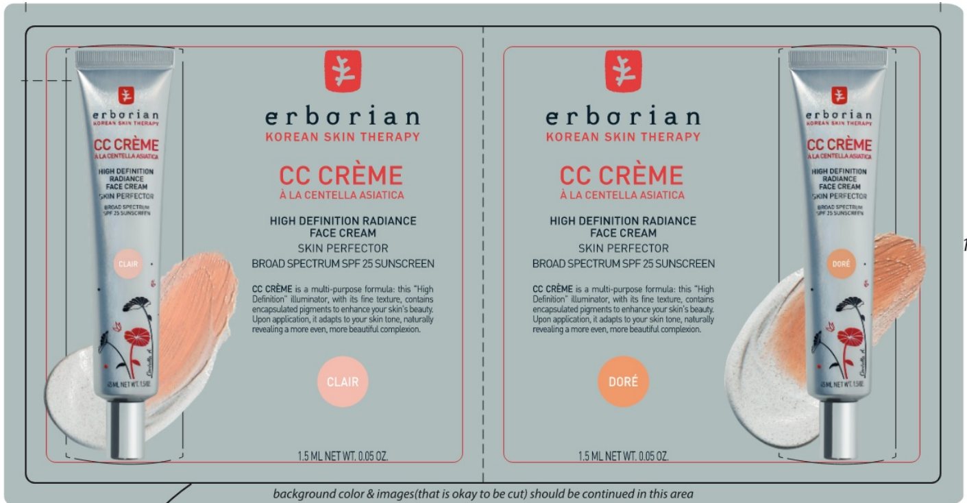
background color & images(that is okay to be cut) should be continued in this area