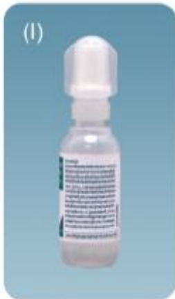
Bottle as you receive it