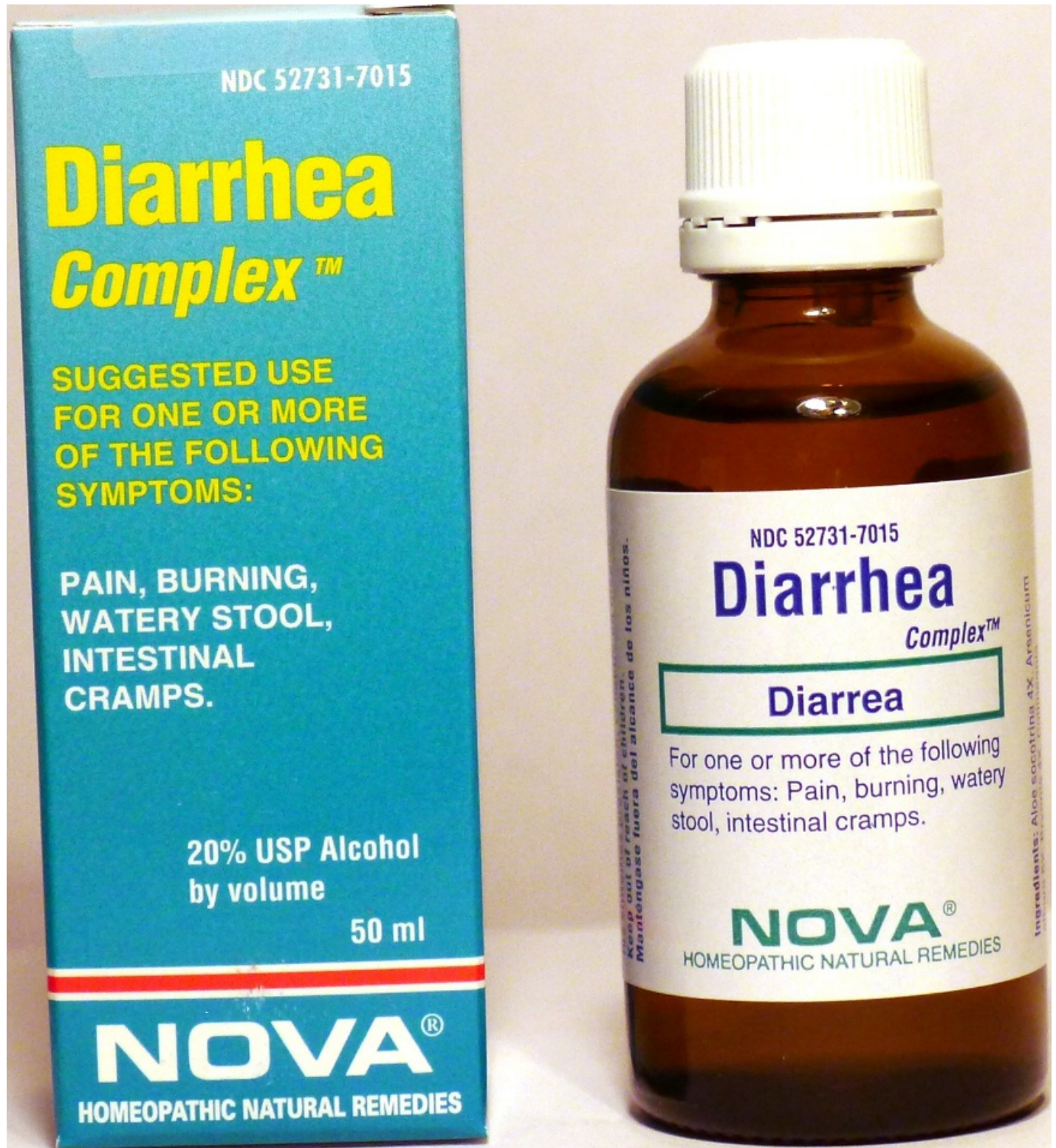
Diarrhea Complex Bottle Label