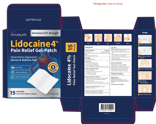
Package Size / 12.5 x 5 x 16 cm