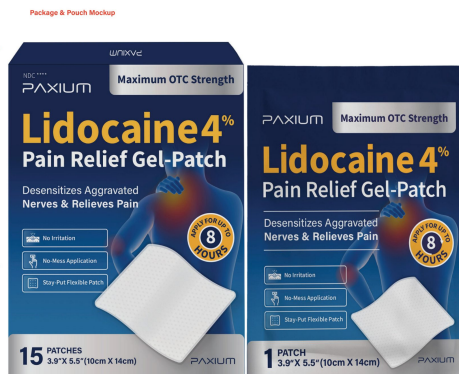
Package & Pouch Mockup