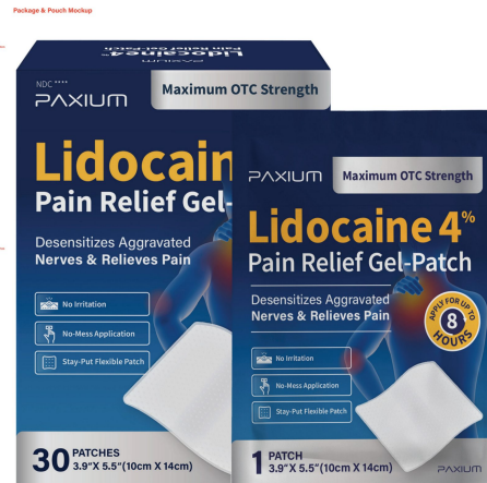
Package & Pouch Mockup