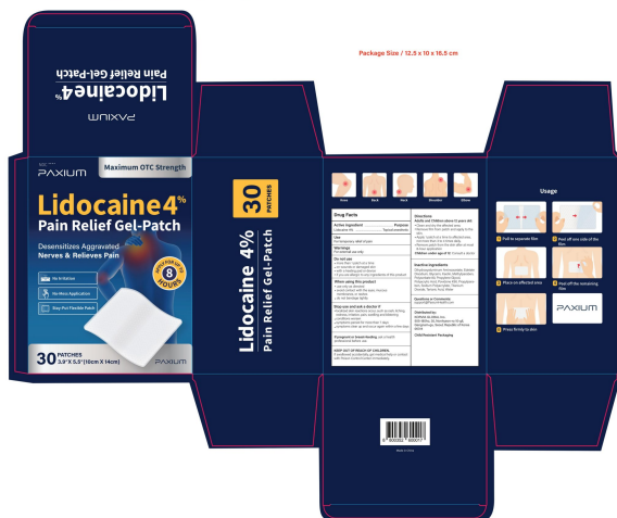
Package Size / 12.5 x 5 x 16 cm