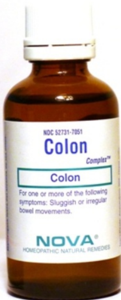
Colon Complex Bottle Label