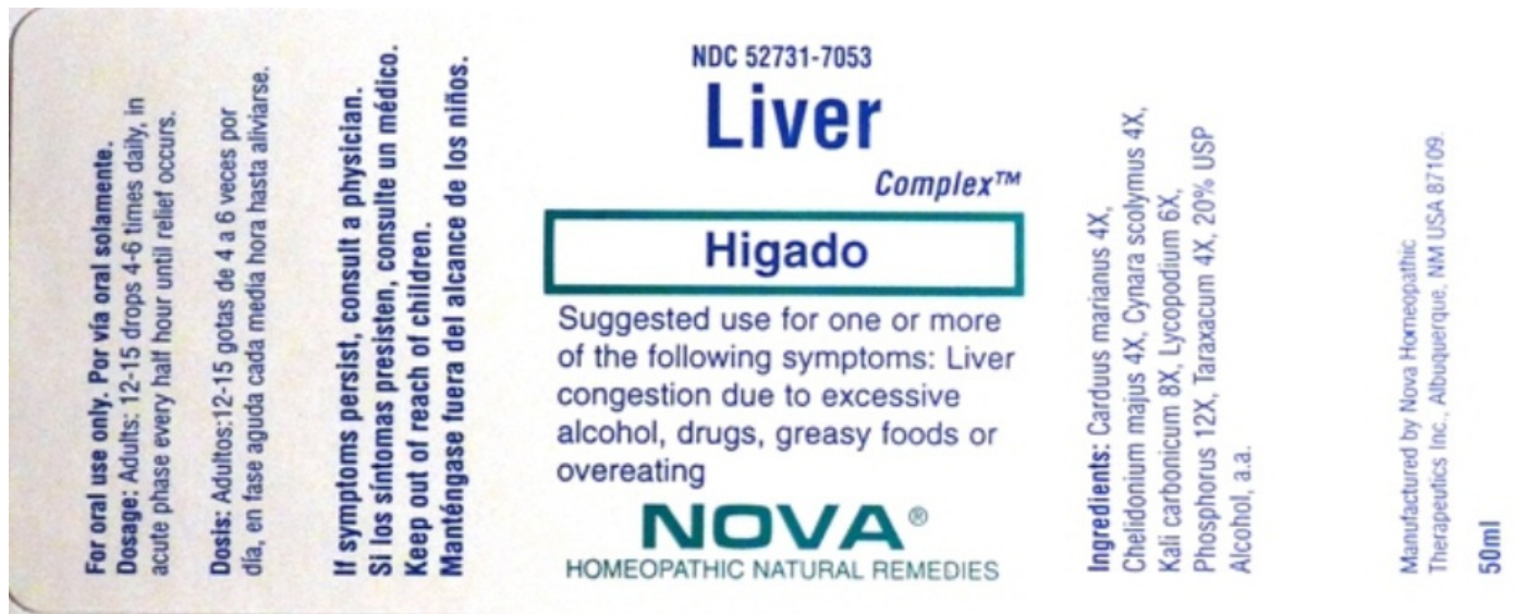
Liver Complex Box