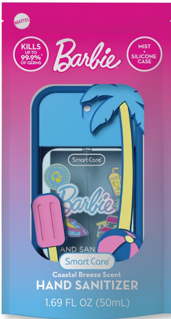
Inner Package Label