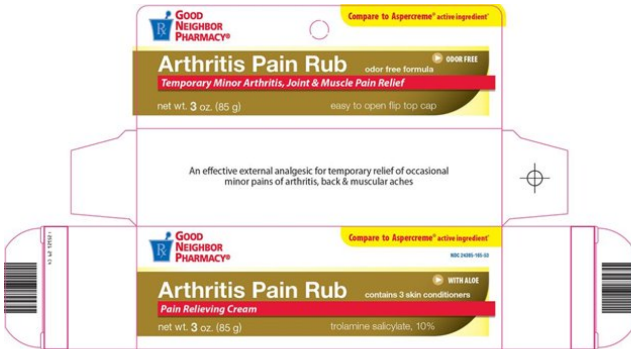
Arthritis Pain Rub Carton Image 1