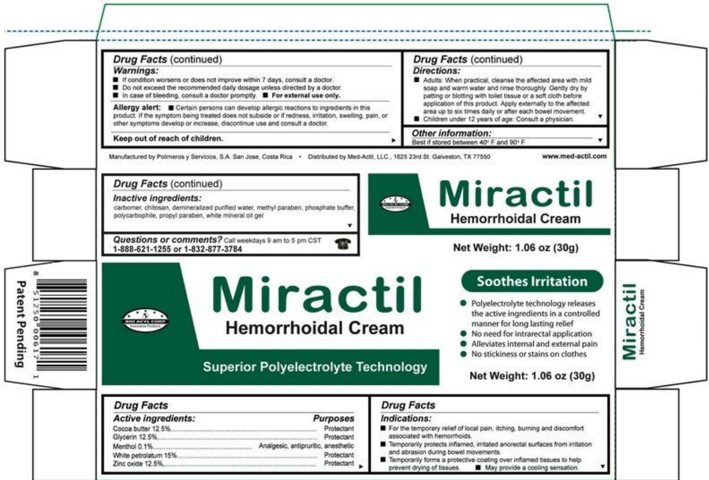
Package content of labeling.jpg