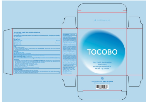
토코보 블러 피니쉬 선 쿠션 01 코튼 블루