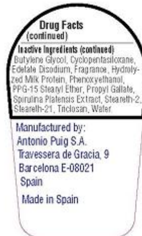
INTERIOR ETIQUETA POLYLABEL