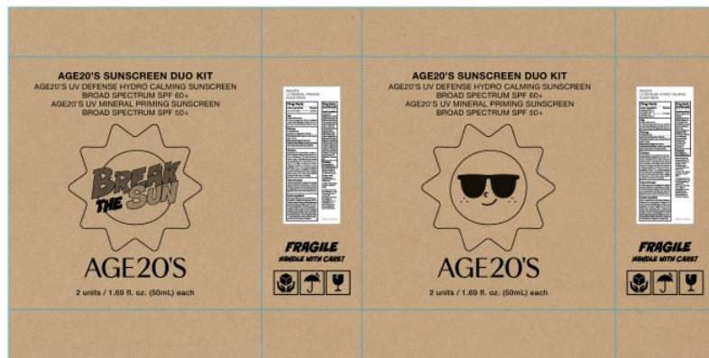
카톤 박스 전개도