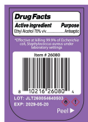
Back Sticker (cover)