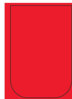
Page 4 (Last Page)

SMART CARE LICENSED HAND SANITIZER HOT WHEELS RED alcohol spray