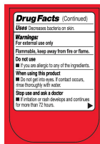
Page 1 (Inside Cover)