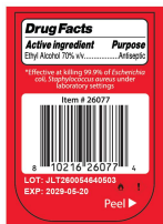
Back Sticker (cover)