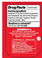
Page 3 (Inside Cover)