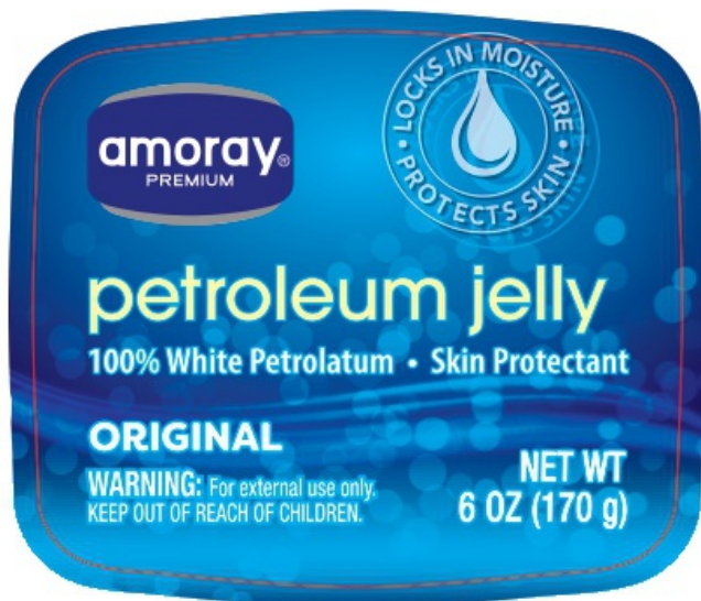
Size 63 x 54mm