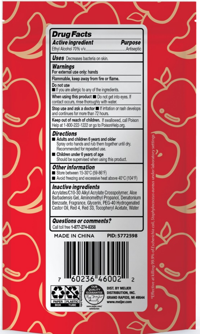
Inner Package Label