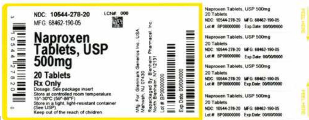
10544-278-20 Bottle Label