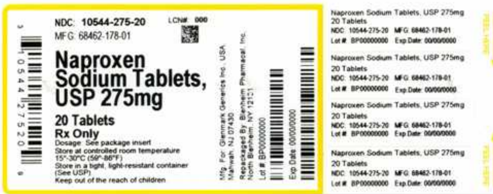
10544-275-20 Bottle Label