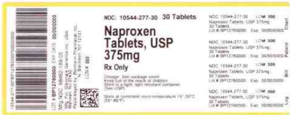
10544-277-30 Bottle Label