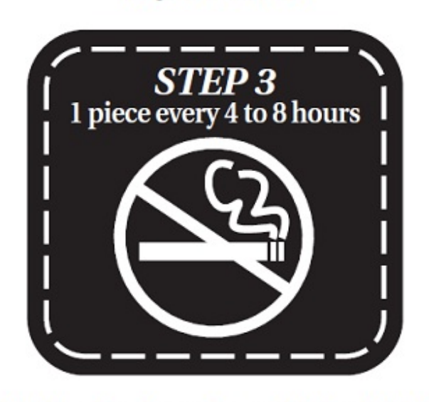
At the Beginning of Week #10