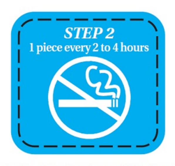
At the Beginning of Week #7