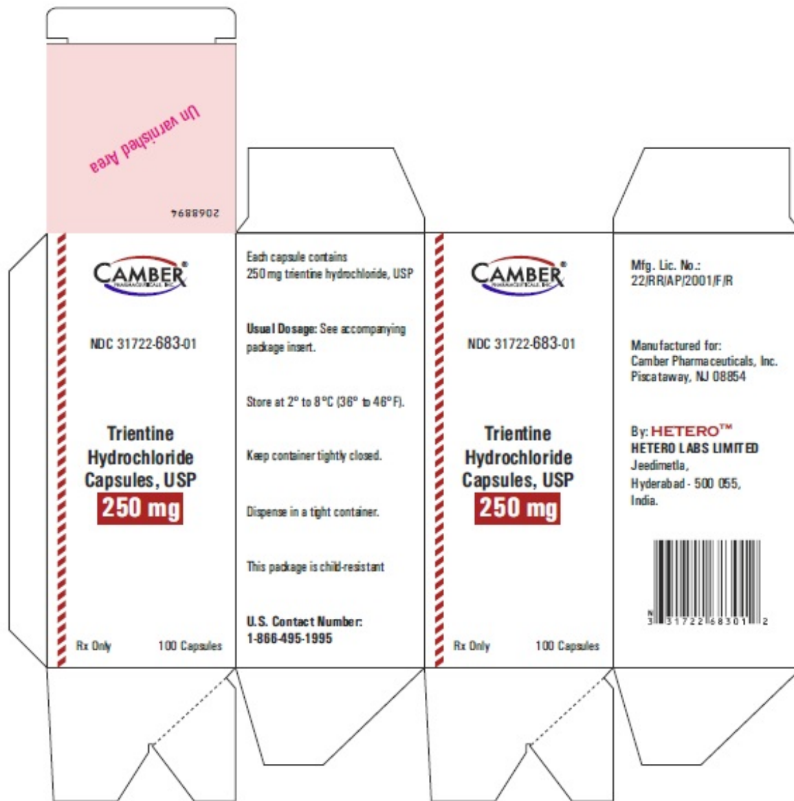
Trientine Hydrochloride Capsules USP 250 mg- Container Label