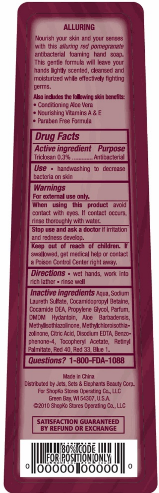
Alluring Red Pomegranate Bottle Label