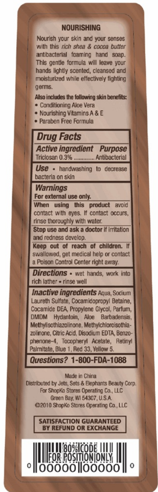
Rich Shea & Cocoa Butter Bottle Label