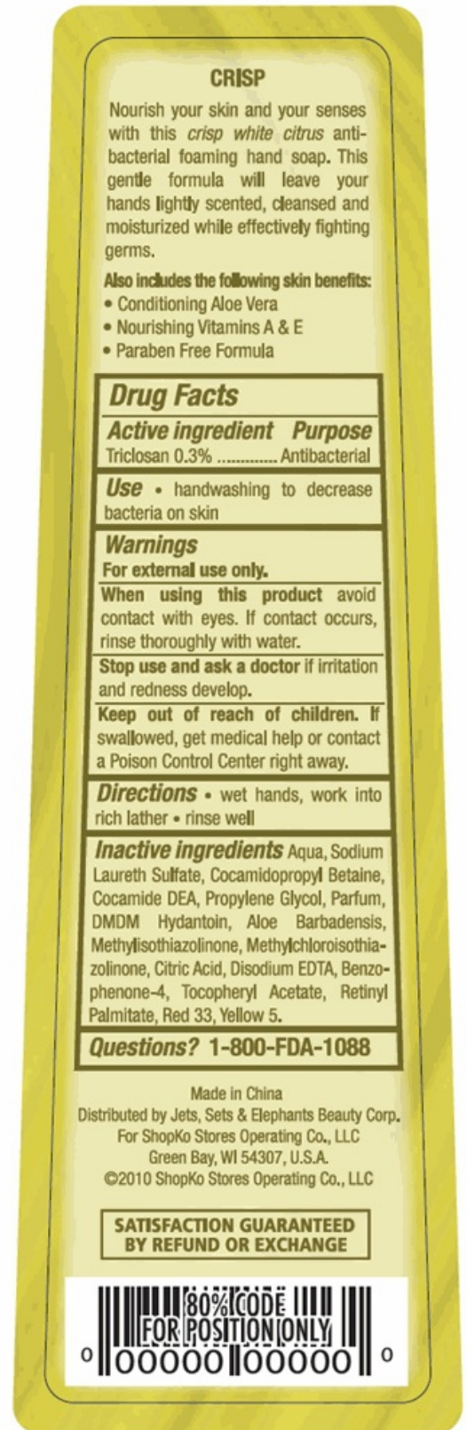
Crisp White Citrus Bottle Label