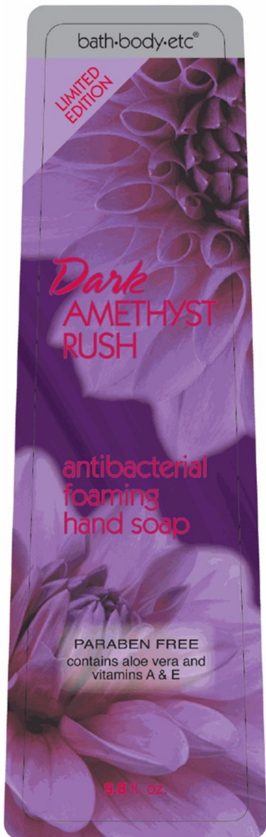
Dark Amethyst Rush Bottle Label