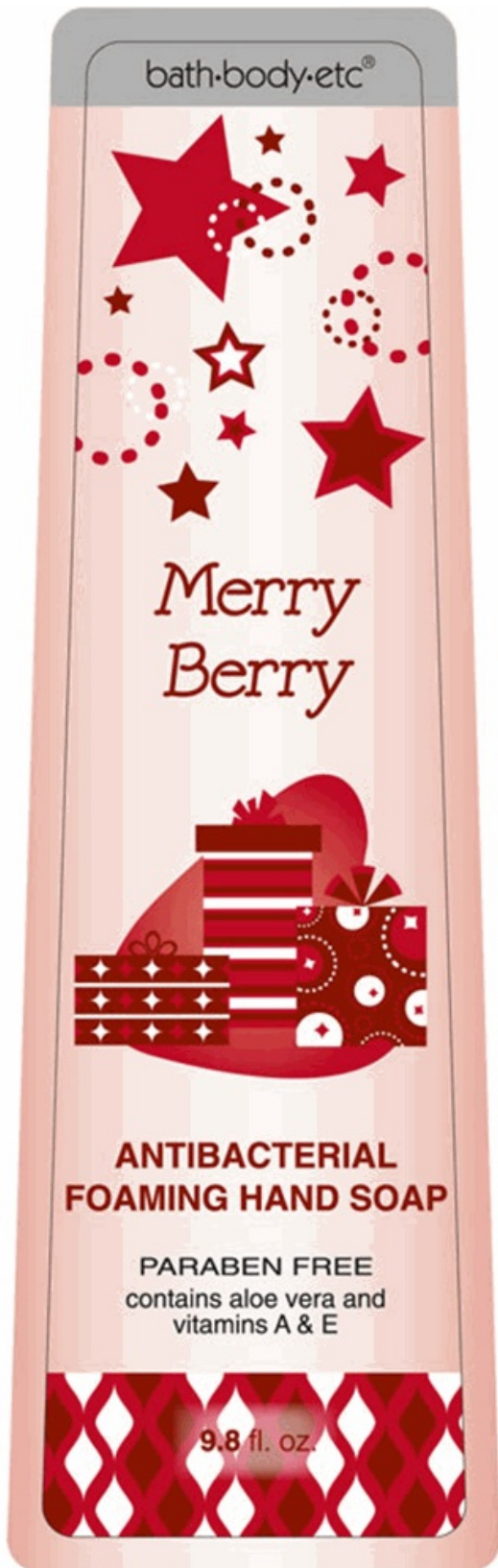
Merry Berry Bottle Label