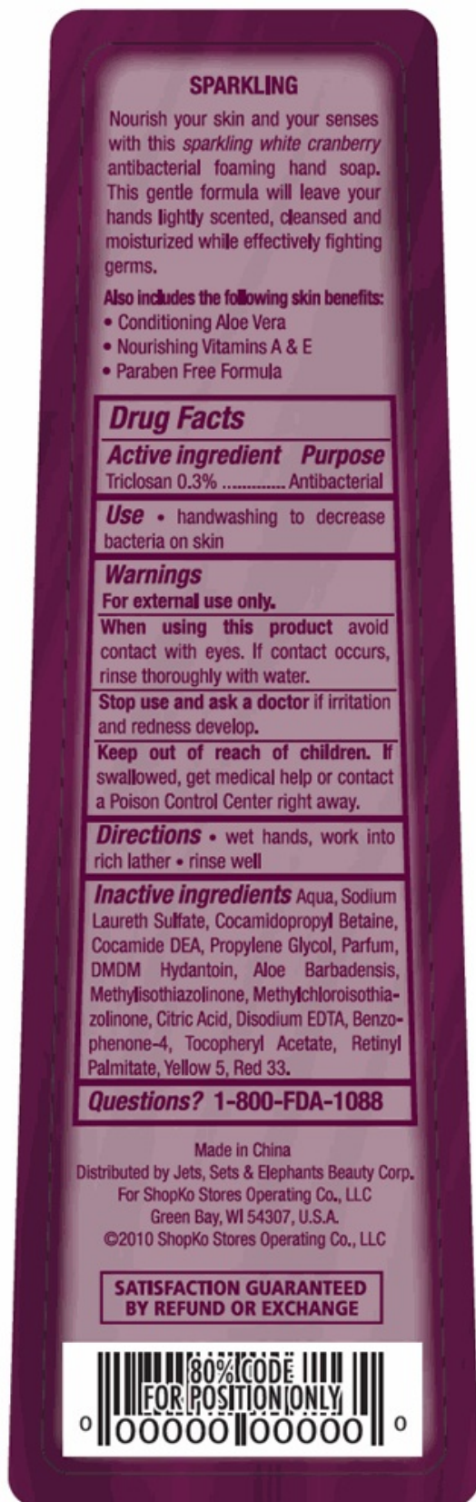
Sparkling White Cranberry Bottle Label