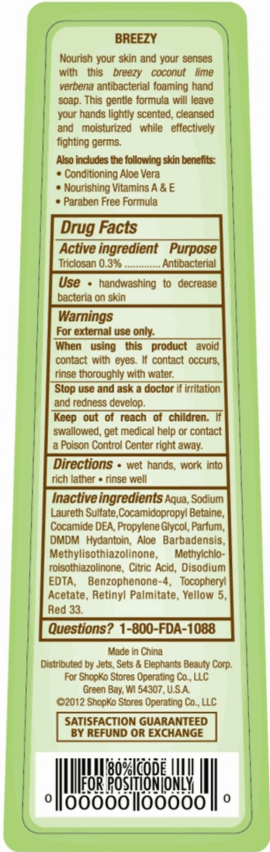
Coconut Lime Verbena Bottle Label