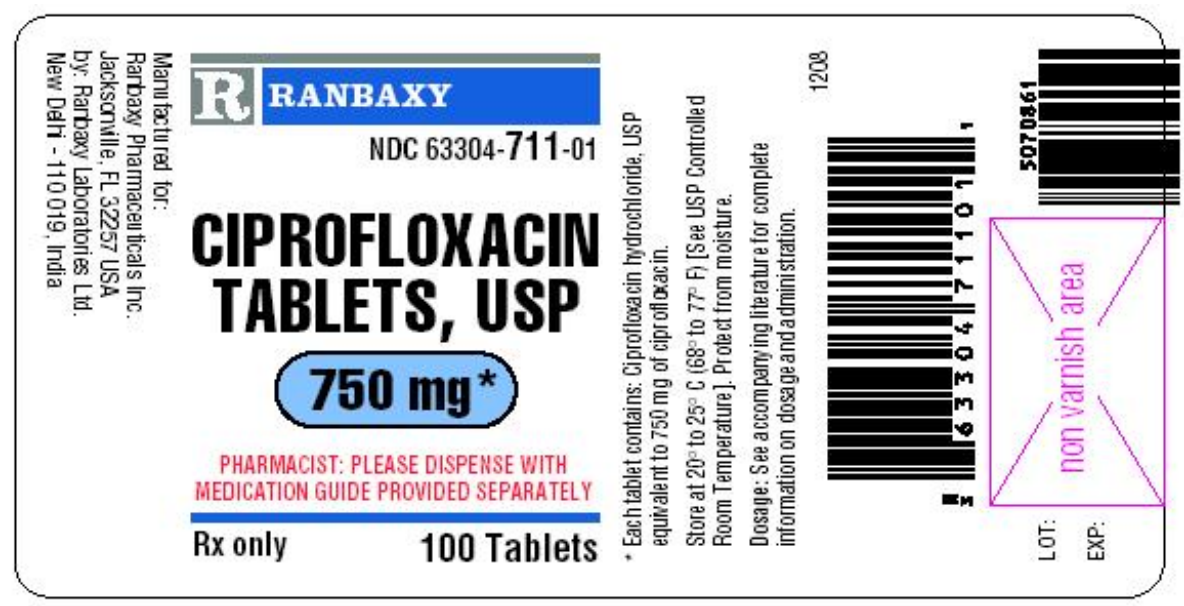
750 mg Bottle Label